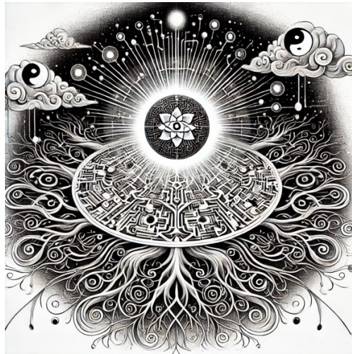
"singularity" -- complex image generated by ChatGPT in response to the above dialog